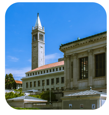
Thousands of families have trusted Elite to guide them into their top-choice UC schools

Please contact us for program details and to schedule a free college prep consultation