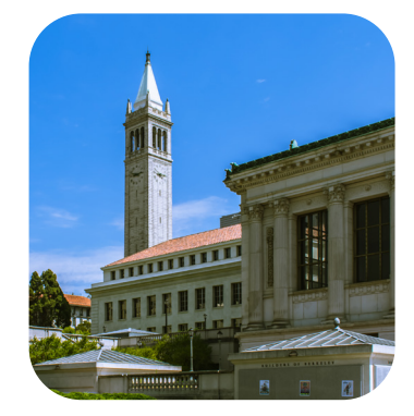
Thousands of families have trusted Elite to guide them into their top-choice UC schools

2022-23 Acceptance Rates UCLA | 9% UC Berkeley | 11% UC Irvine | 21% UCSD | 24% UCSB | 26%