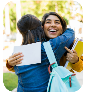
Strong SAT scores help students stand out at both test-required and test-optional schools