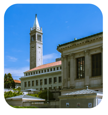
Thousands of families have trusted Elite to guide them into their top-choice UC schools

2022-23 Acceptance Rates UCLA | 9% UC Berkeley | 11% UC Irvine | 21% UCSD | 24% UCSB | 26%